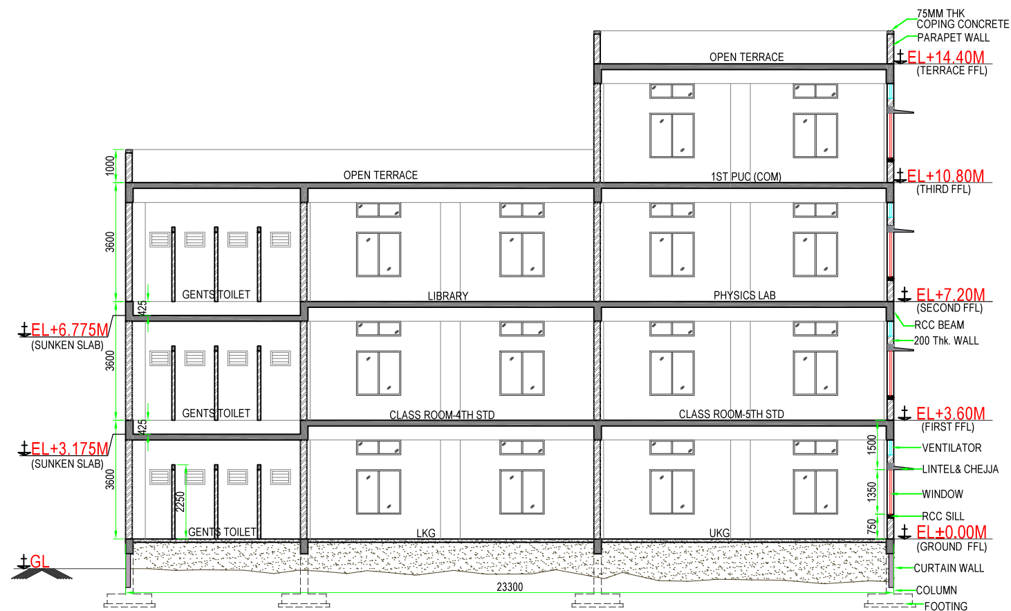
CROSS SECTION @ 'B-B' (SCALE - 1:100)