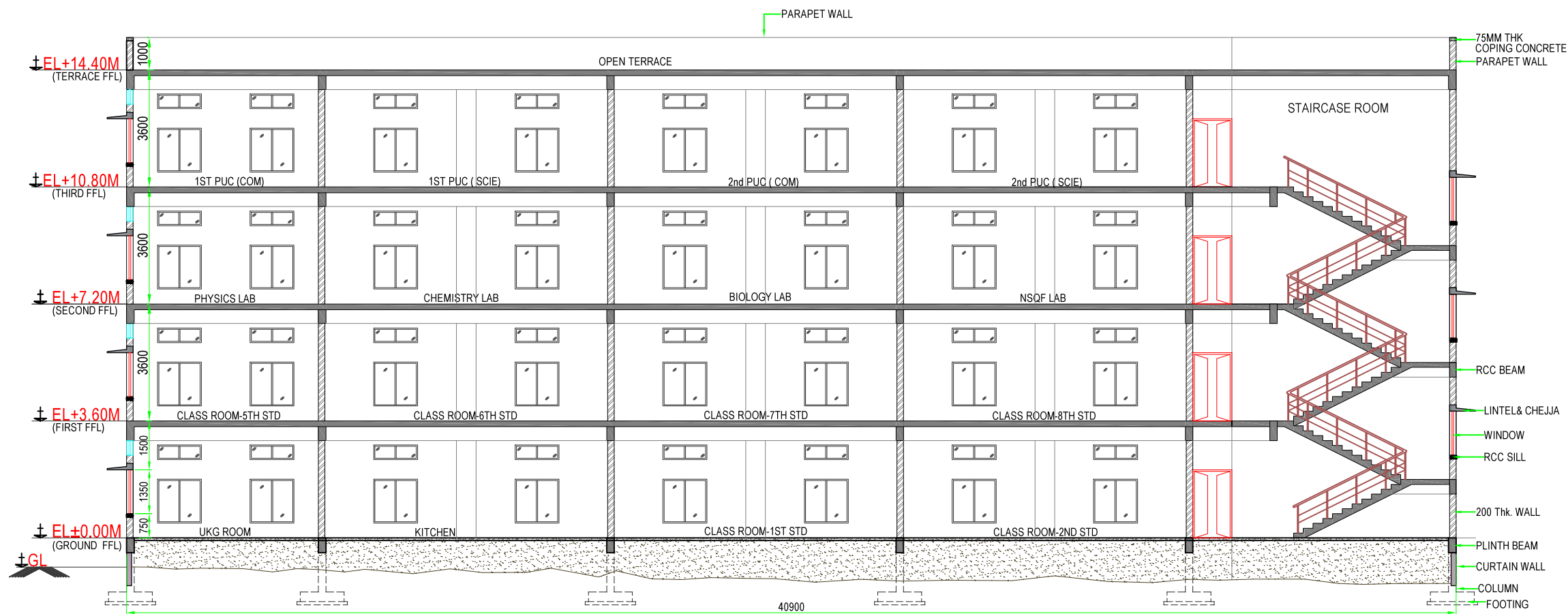
CROSS SECTION @ 'A-A' (SCALE - 1:100)